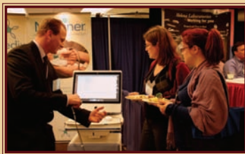
The Latest Products on Display