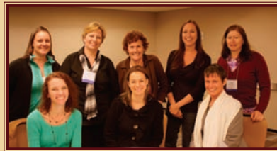
Coast to Coast Networking