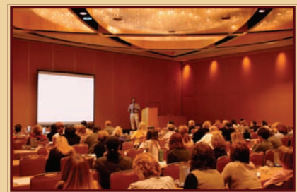
Learning from the Experts