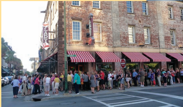
Nurses gather to enjoy dinner at Paula Deen's Lady and Sons restaurant.