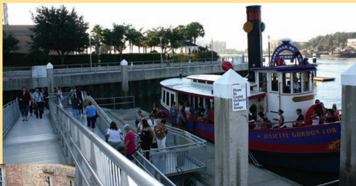
Getting ready to start the day with a water taxi ride across the Savannah River.