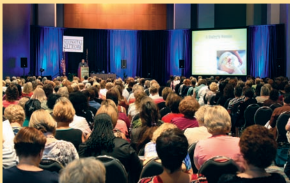
Morning general session